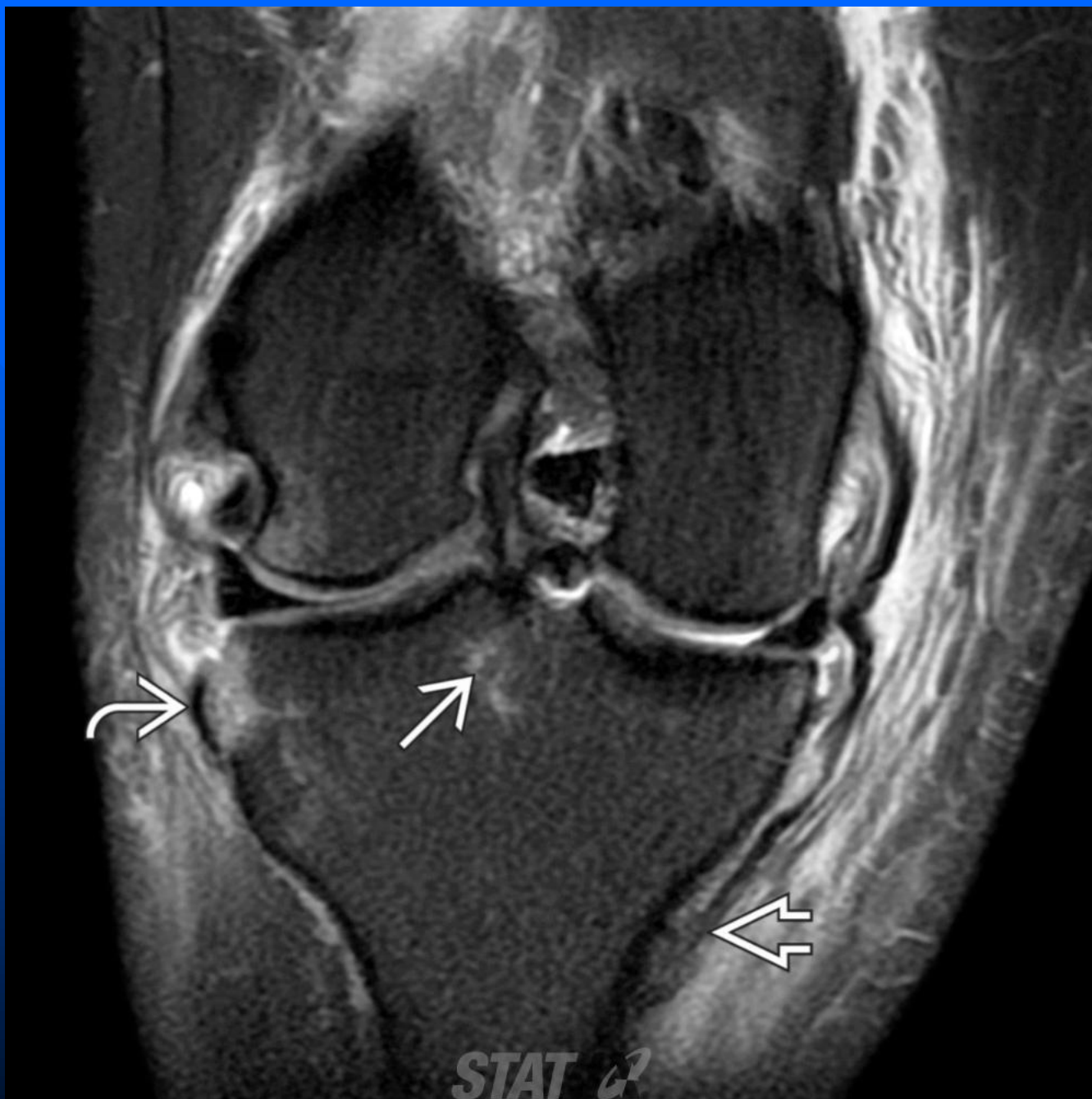
Coronal T2WI FS MR from the same patient shows the Second avulsion (white curved arrow), as well as disruption of the distal medial collateral ligament (white open arrow). The ACL avulsion (white solid arrow) is partially seen, located more anteriorly.